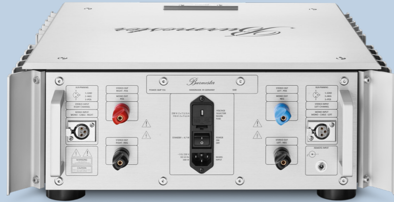
956 MK2 CLASSIC LINE